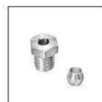
Compression parts : P.169