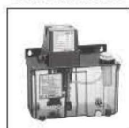
AMZ-III : P.93