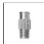
Push-in Fitting : P.182