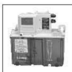
AMO-II -150S : P.99