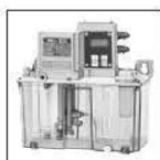
AMO-III DS : P.97