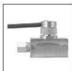
Ludo-sensor : P.164