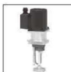
AMI-300S · 1000S : P.101