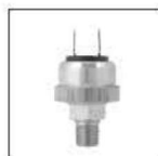
Pressure switch : P.163