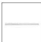
Tubing : P.171