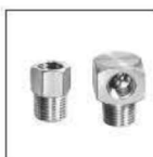
Adapters : P.175