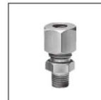
Adapter assemblies : P.185