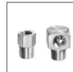
Adapters : P.175