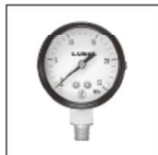
Pressure gauge : P.85