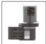
P-107 : P.35