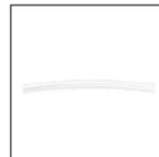
Branch tubing : P.171