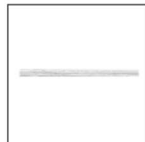
Main tubing : P.174