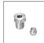
Compression parts : P.169