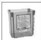
Reservoir : P.146