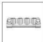
PJ junction : P.141