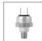
Pressure switch : P.163