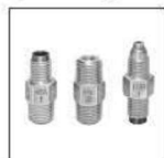
Flow unit : P.129