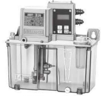
[3 L Reservoir type]