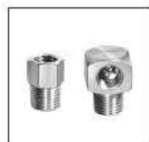
Adapters : P.175