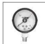
Pressure gauge : P.162