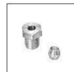
Compression parts : P.169