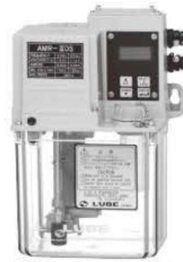
[1.8 L Reservoir type]

Capable of operating over a wide range of working viscosity. Digital display gives on sight visual indication of operation. Interval can be a function of time or count.