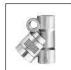
Filter FY-20 : P.159