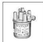
Filter FX-1 : P.159